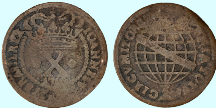
Lot 2: 1715-1720 Brazil 10 Reis, Good, KM #108