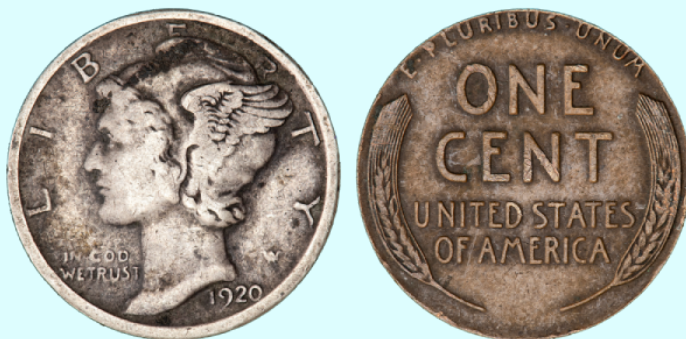
Lot 3: Magician Coin, 1920 Mercury Dime paired with Lincoln Cent Wheat Reverse