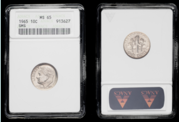
Lot 1: 1965 Roosevelt Dime, ANACS MS65 SMS